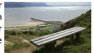
View from the Great Orme

The programme will be arranged primarily for the Saturday, with time for prayer, discussion and faith sharing, and plenty of free time. For those who can stay for the weekend, there would be additional time for reflecting, socialising and enjoying Llandudno.